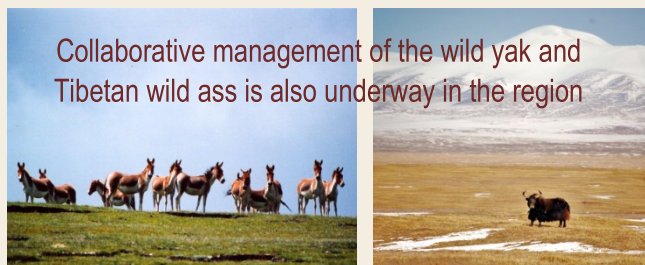
Collaborative management of the wild yak and Tibetan wild ass is also underway in the region